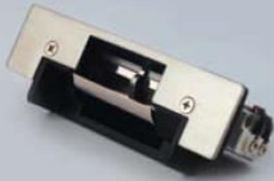
eLock-S230M / eLock-S230MF