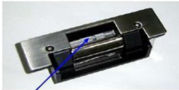
Door Status Signal ( Micro Switch )