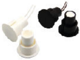
EL-840P / EL-840PB