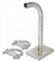
Bracket EL-RSCM600 Outdoor