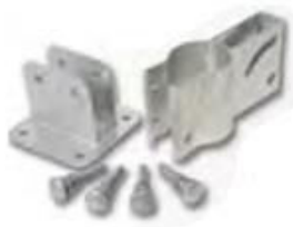
Bracket EL-RSCM800 Outdoor