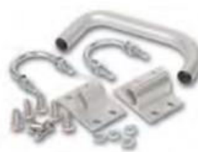
Bracket EL-RSCM490 Outdoor