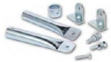
Bracket EL-RSCM490 Indoor