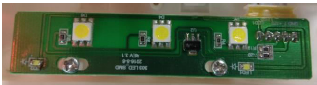
Alarm Indicator LEDs Flashlight