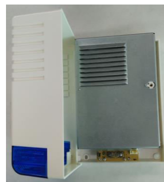
Internal Metal Protection