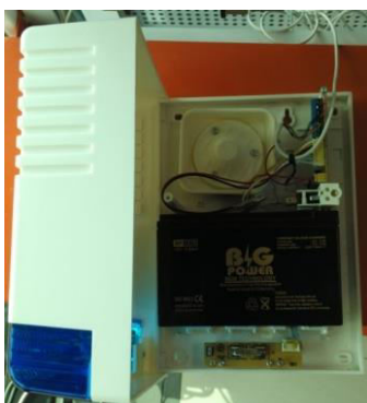
Backup Battery 12V 7AH